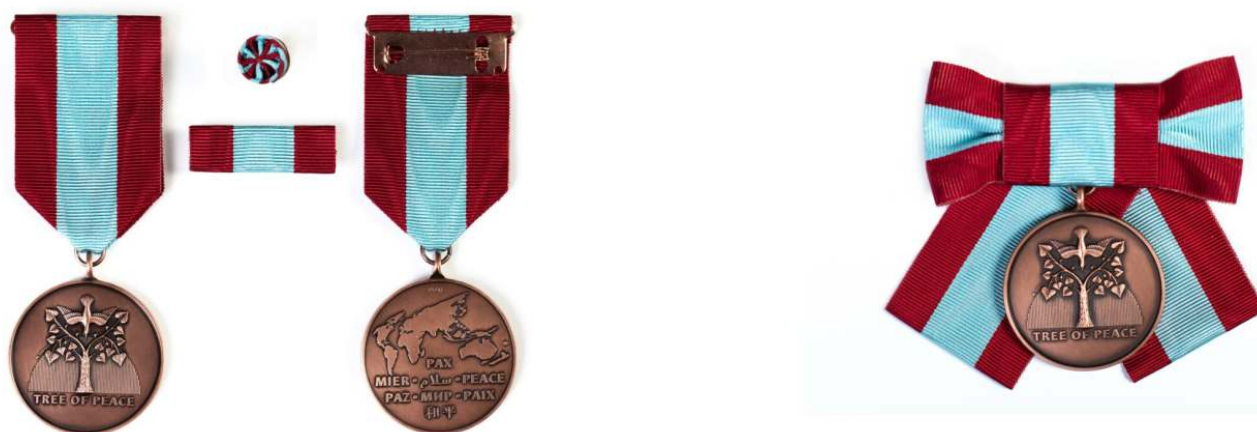
Memorial Medal of Tree of Peace, obverse and reverse

Friend of Peace is an honorary title and honourable mention of Servare et Manere. By receiving this title and award, personalities express a formal support for the international project the Tree of Peace in the country of their birth. This honour may also be associated with exclusive Patronage over the Project in a particular country. Good ideas and projects need the support of strong friends. The number of laureates is not limited. Laureates are included in a special register. The Friend of Peace is intended only for living persons and cannot be granted to an organization.